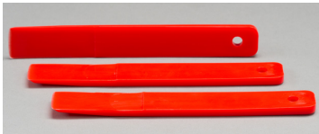
Semco sealant removal tool