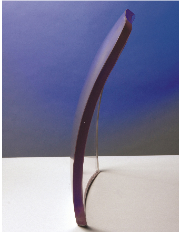
Unique non-uniform shapes can be created with Opticor advanced transparency material.

of developing aircraft transparency interlayers, they were able to create a new plastic with the characteristics to meet the demanding needs of the aerospace industry today and in the future.